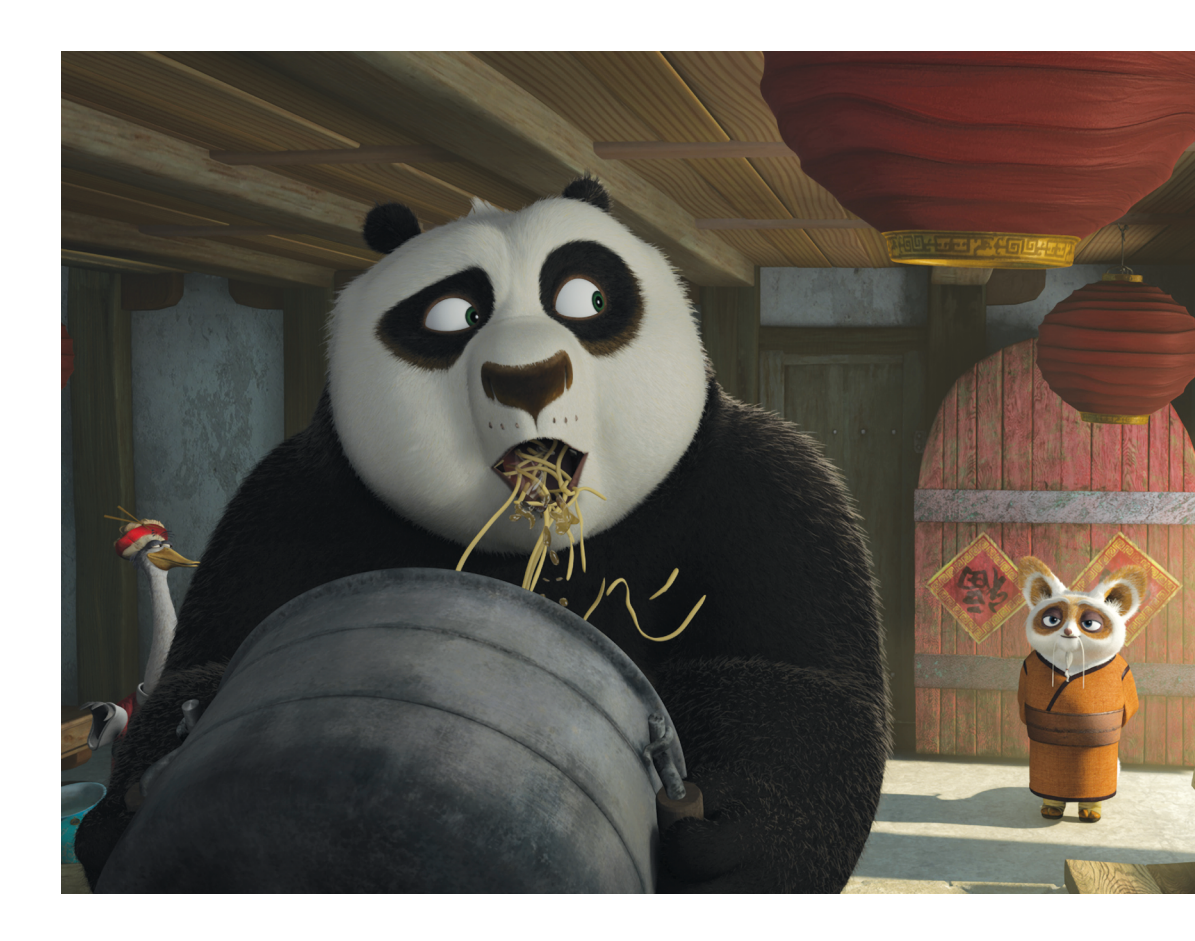
Master Shifu goes to Po's home.

'At Winter Festival, the Dragon Warrior gives a dinner at the Jade Palace. You choose the cook!' Master Shifu says.