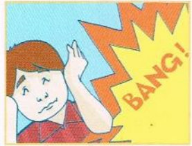
a loud noise