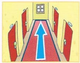
a long corridor