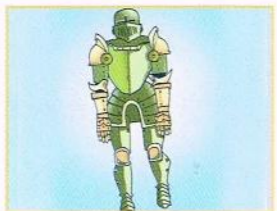
a suit of armour