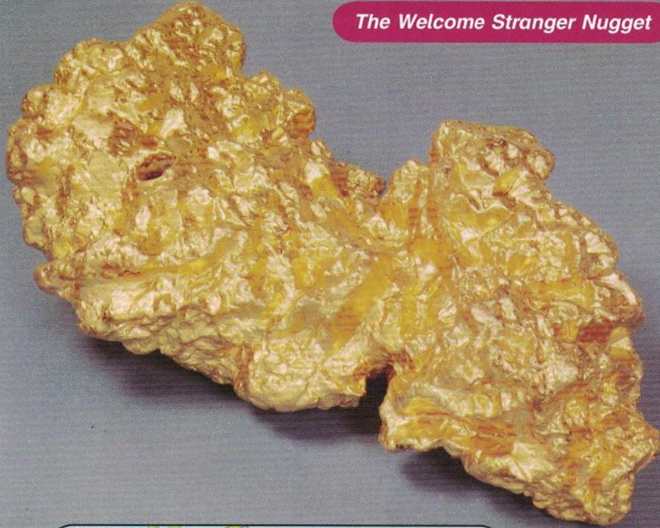
The Welcome Stranger Nugget

There is very little gold in the world. This is why gold is expensive. There is gold in the sea, but it is very hard to reach. The biggest piece of gold in the world came from Australia. It weighed more than 71 kilograms.