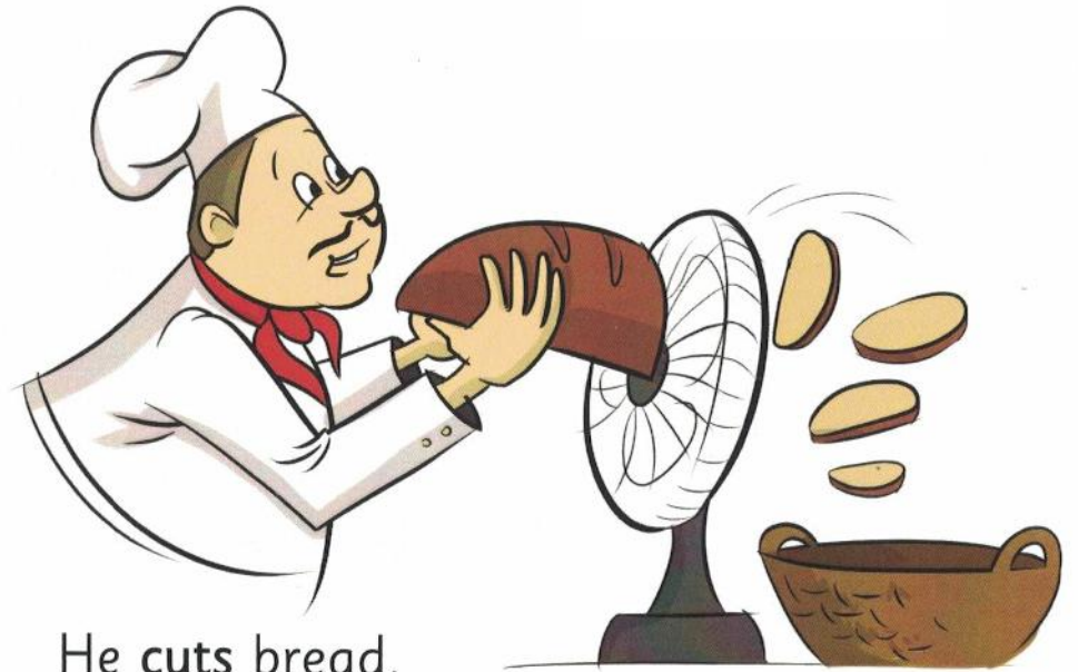
He cuts bread.