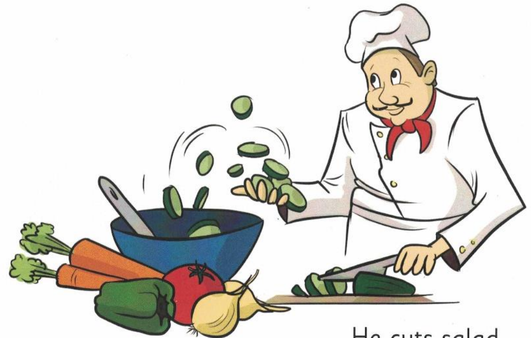
He cuts salad.