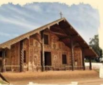
Mission church of San Miguel de Velasco

The Jesuits came from Europe and arrived in South America in the 16th and 17th centuries. Here they built the first churches. They are very big and beautiful. Inside you can see great works of art.